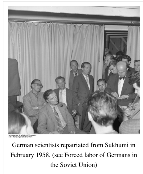
German scientists repatriated from Sukhumi in February 1958. (see Forced labor of Germans in the Soviet Union)

During the decades after they were included in Operation Paperclip, some scientists were investigated because of their activities during World War II. Arthur Rudolph was deported in 1984, but not prosecuted, and West Germany granted him citizenship. [21] Similarly, Georg Rickhey, who came to the United States under Operation Paperclip in 1946, was returned to Germany to stand trial at the Mittelbau-Dora war crimes trial in 1947, was acquitted, and returned to the United States in 1948, eventually becoming a U.S. citizen. [22] The aeromedical library at Brooks Air Force Base in San Antonio, Texas had been named after Hubertus Strughold in 1977. However, it was later renamed because documents from the Nuremberg War Crimes Tribunal linked Strughold to medical experiments in which inmates from Dachau were tortured and killed. [23]