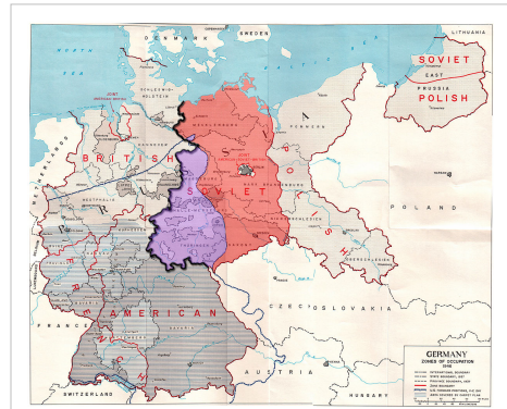
The Allied zones of occupation in post-war Germany, highlighting the Soviet zone (red), the inner German border (heavy black line) and the zone from which British and American troops withdrew in July 1945 (purple). The provincial boundaries are those of pre-Nazi Weimar Germany, before the present Länder (federal states) were established.

John Gimbel concludes that the U.S. put some of Germany's best minds on ice for three years, therefore depriving the German recovery of their expertise. [15]